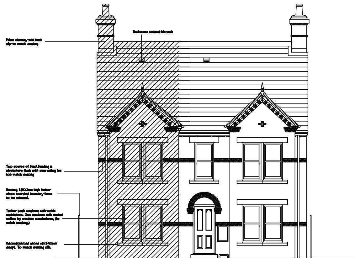
FRONT ELEVATION (WEST)