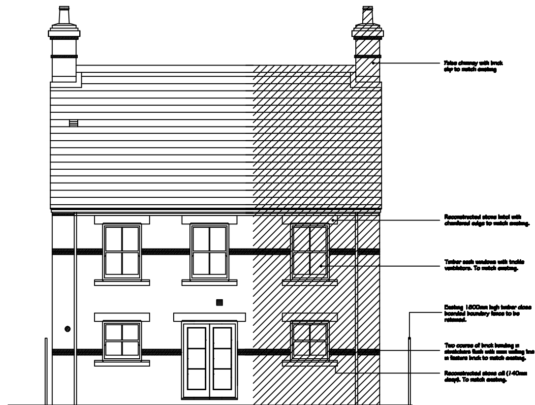
REAR ELEVATION (EAST)